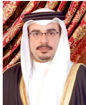
His Royal Highness, Prince Salman bin Hamad Al Khalifa

The Crown Prince, Deputy Supreme Commander and Prime Minister