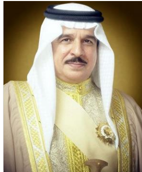
His Majesty King Hamad bin Isa Al Khalifa